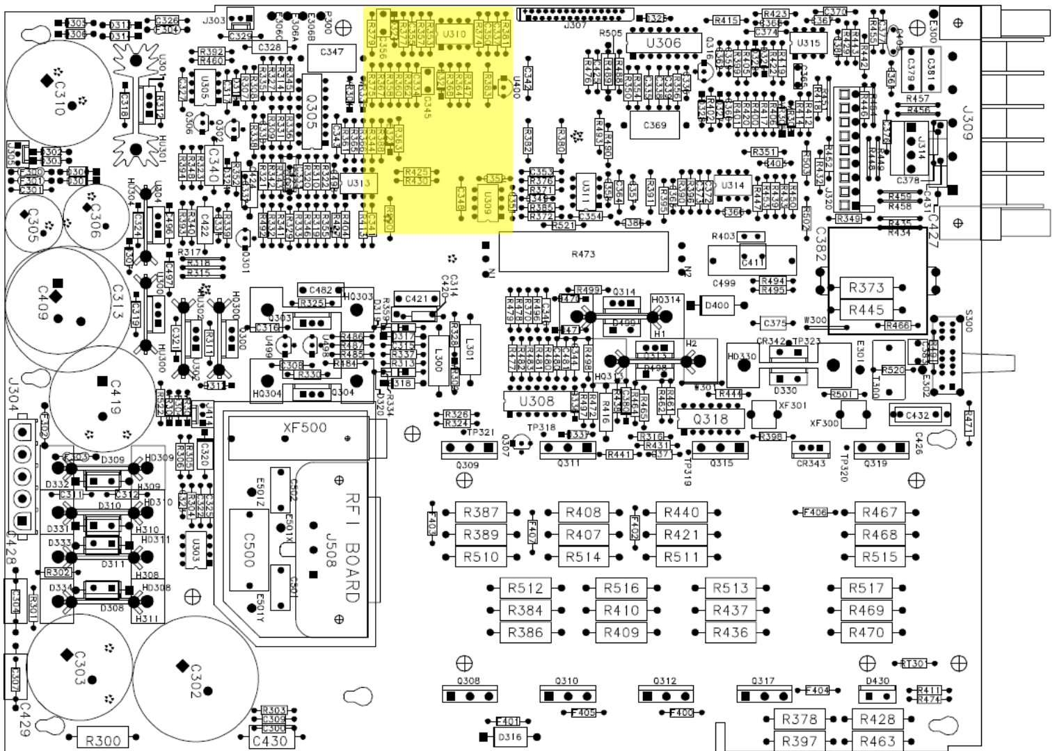
Figure 1. A1 Board Layout