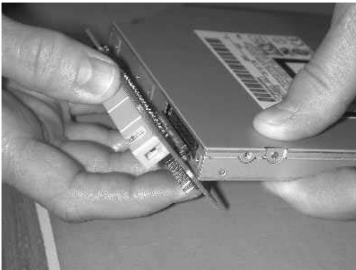
Figure 2 – A15 and A17 assemblies.