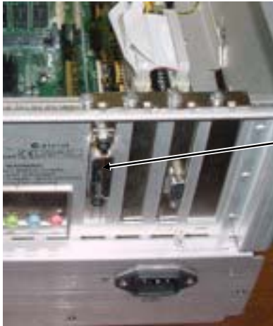
A11GPIB Board Assembly inserted in the A4PCI 1 Slot with previous revision of the A4 Motherboard