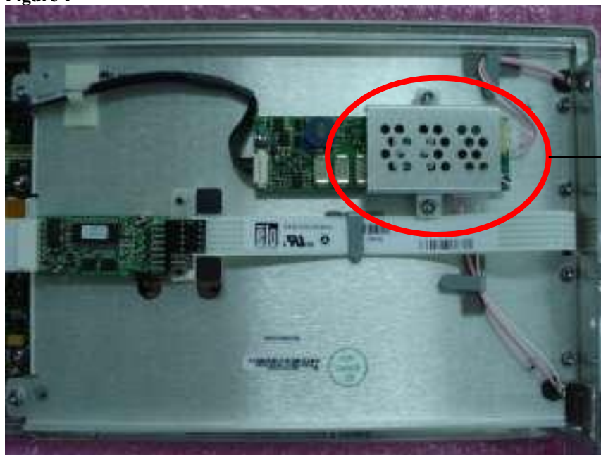
Figure 1: Old inverter shield N5230-00013